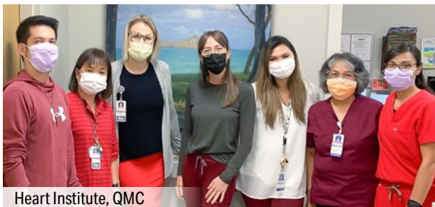
Heart Institute, QMC