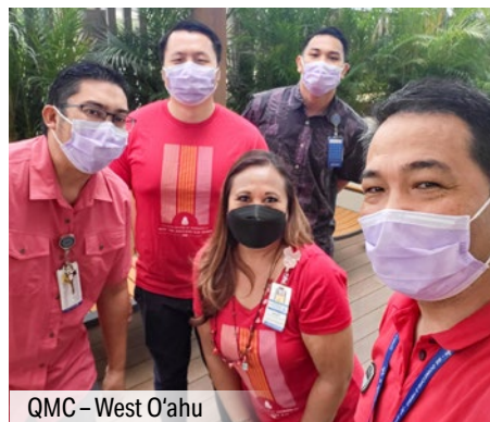
QMC - West O'ahu