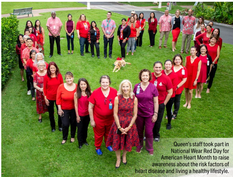
Queen's staff took part in National Wear Red Day for American Heart Month to raise awareness about the risk factors of heart disease and living a healthy lifestyle.