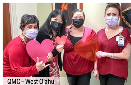
QMC - West O'ahu