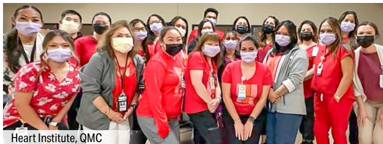
Heart Institute, QMC